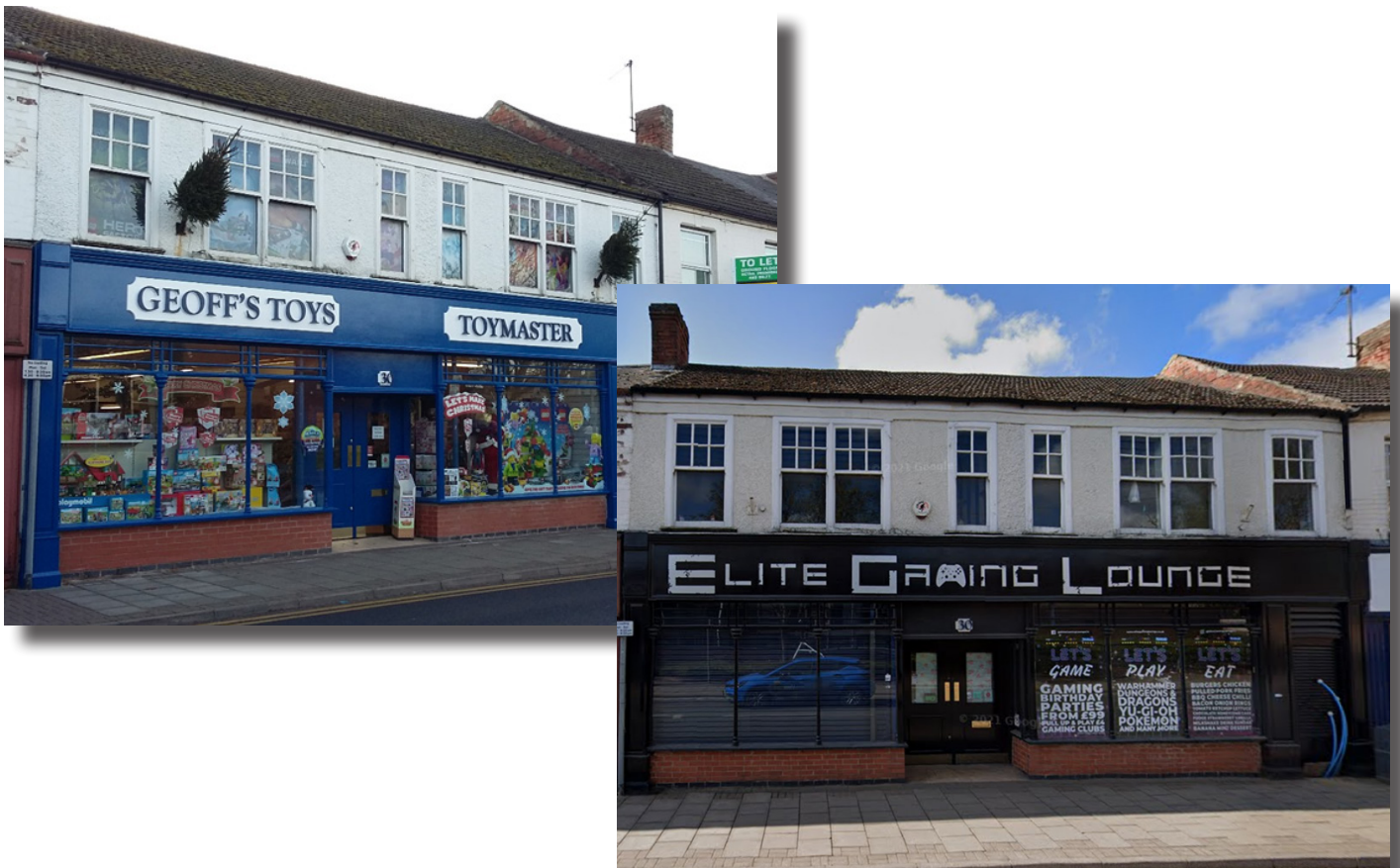
Appendix 1. Before and after photos